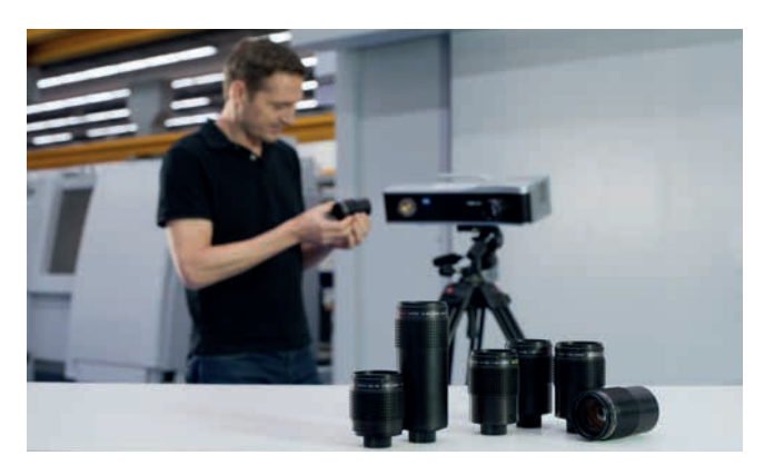
The right sensor for every application:

The high-performance software platform colin3D ensures a consistently efficient and project-oriented procedure during the entire measuring process.